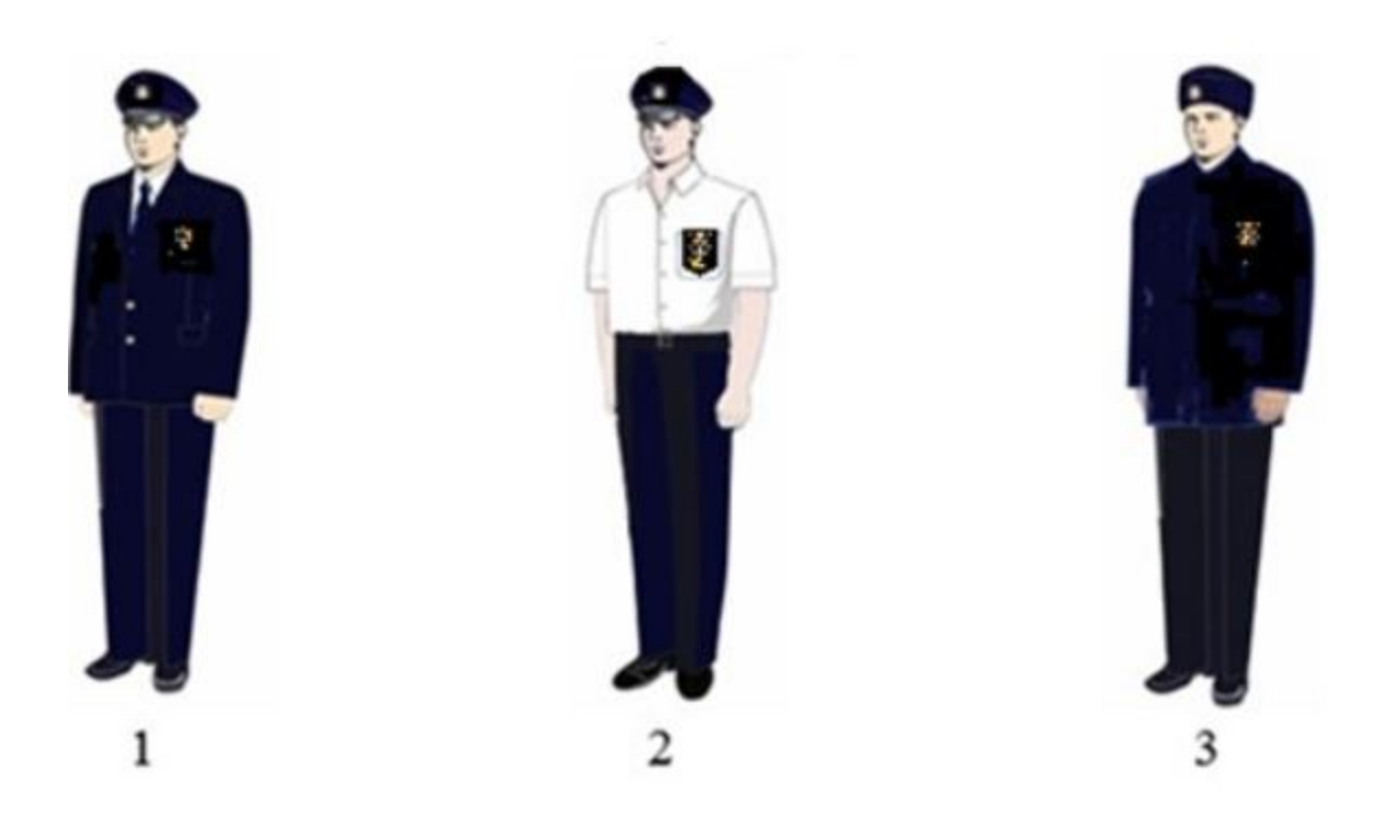
Figure 1 Note: 1 - everyday uniform; 2 - summer uniform; 3 - winter uniform.